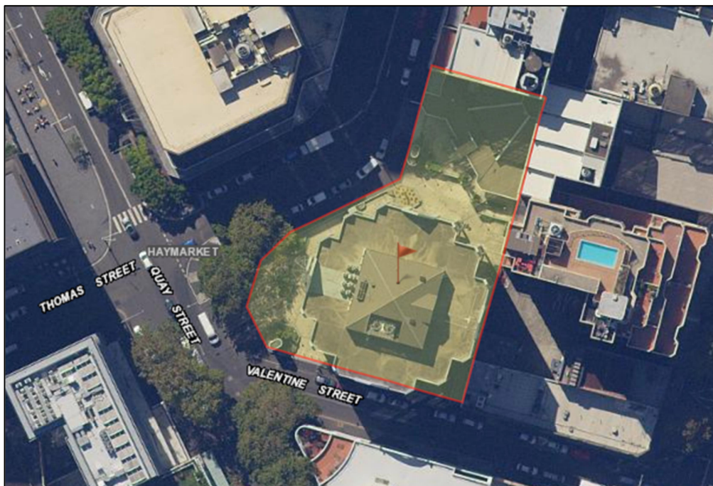
Figure 2: Aerial view with the competition site bounded read and shown yellow