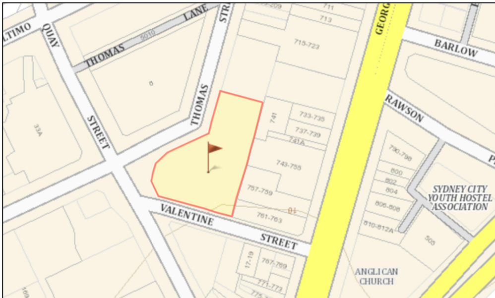
Figure 1: Site location with the competition site bounded read and shown yellow

The Competition will apply to the full extent of the site and development under the Draft DCP controls.